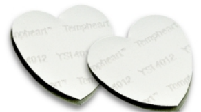
MEAS4012 Mini-Tempheart Shields