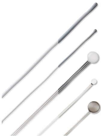
MEAS 400 Series Medical Probes